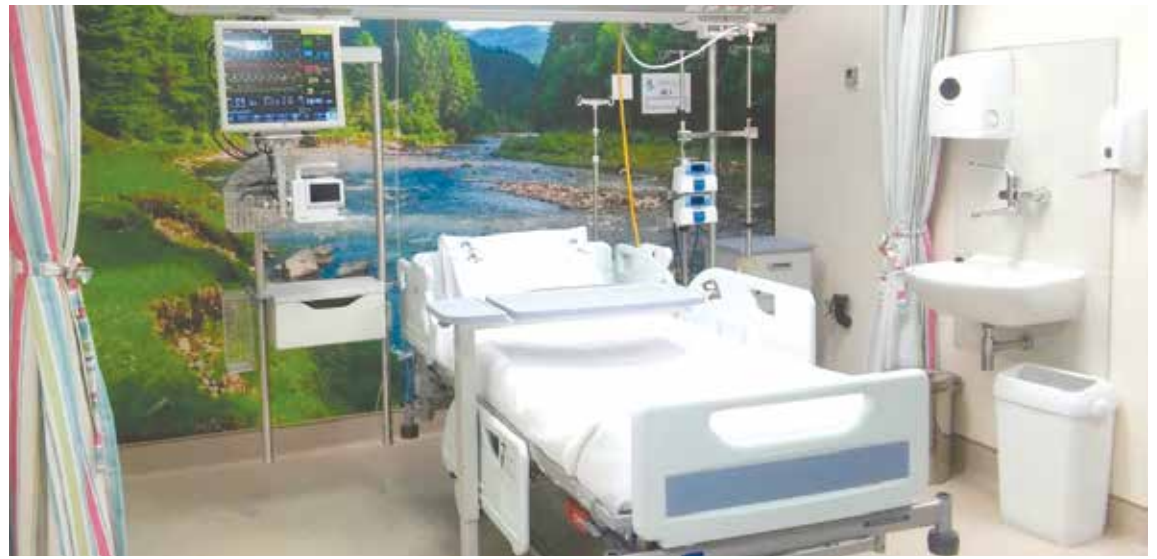
Intensive Care Unit